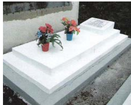
#3B Slab plus 2 layers with the plaque on a raised concrete base