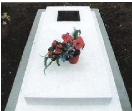
#3A Slab plus 2 layers with the plaque embedded flush into the top