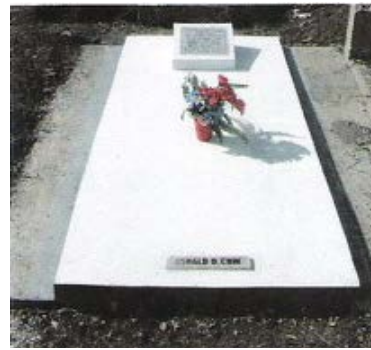
#1B Slab with the plaque on a raised concrete base