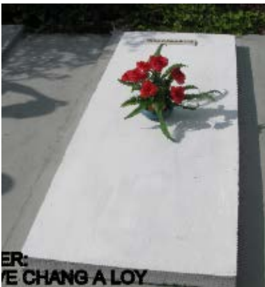
#2A Slab plus layer with the plaque embedded flush into the top