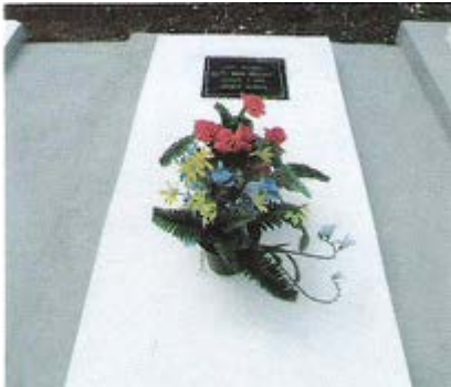
#1A Slab with the plaque embedded flush into the top

Basic examples, based on current costs, subject to increases in materials & labour costs.