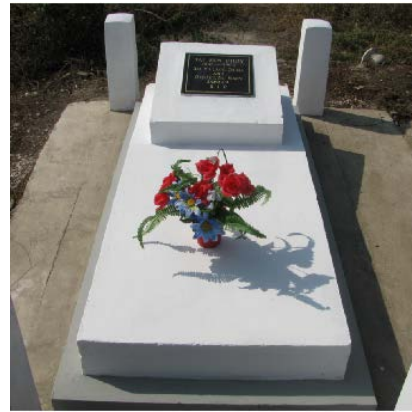
#2B Slab plus layer with the plaque on a raised concrete base